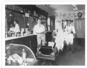
Brekner Barber Shop