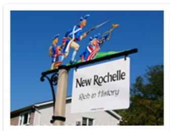
Street sign designed by Norman Rockwell