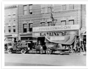
Lowes Theater promoting The Covered Wagon in 1923