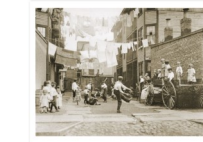
Trinewent playground in 1910