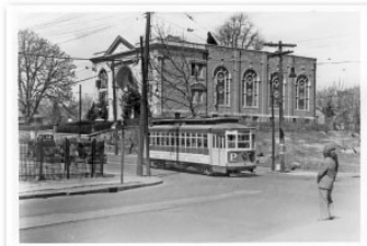
Hebrew Institute (later renamed Beth El)