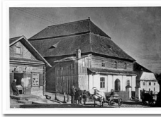
The Synagogue in Glubokoye circa 1902