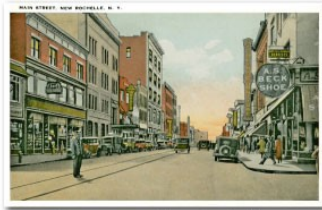
Downtown New Rochelle