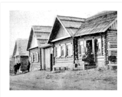
Typical Glubokoye Houses