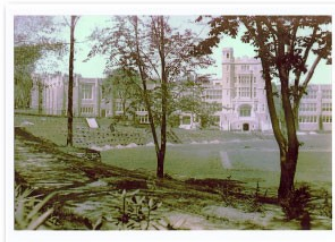
Isaac E. Young Jr. High School