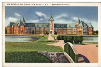
New Rochelle High School