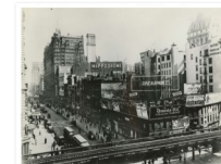
34th St. and 6th Ave., 1910