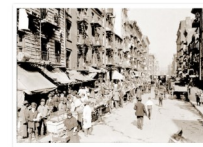
Lower East 53rd Street