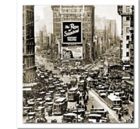
Times Square, 1922