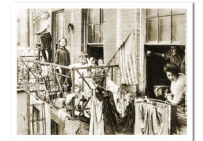
NY throughout the decade