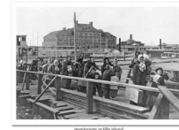
Immigrants at Ellis Island