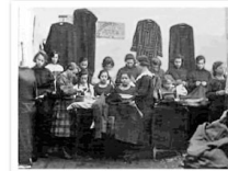
Girls' Sewing Class in 1923