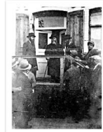
Rebe visits in 1934