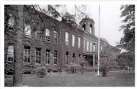
Trinity Place Elementary School